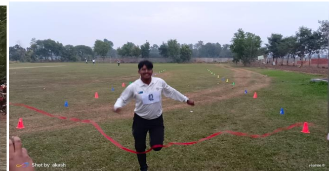
Celebration of Fit India Week 2023 at Seacom Skills University campus