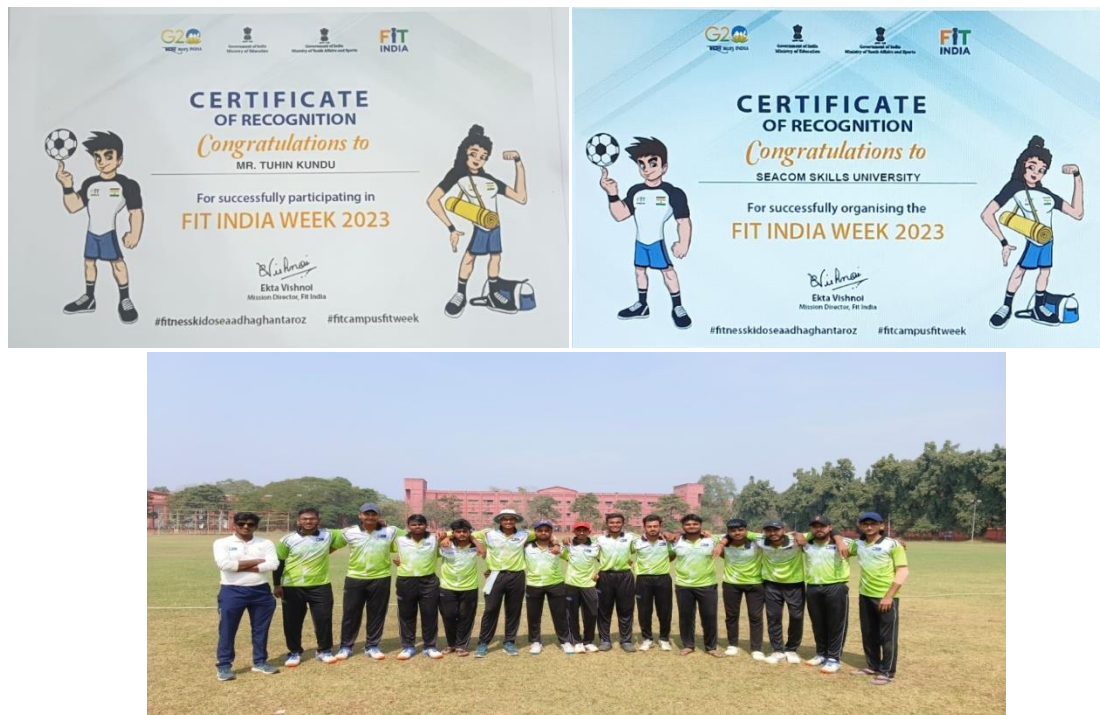
SSU Cricket Team at Ravenshaw University ground, Cuttack –National University Games 2023-24